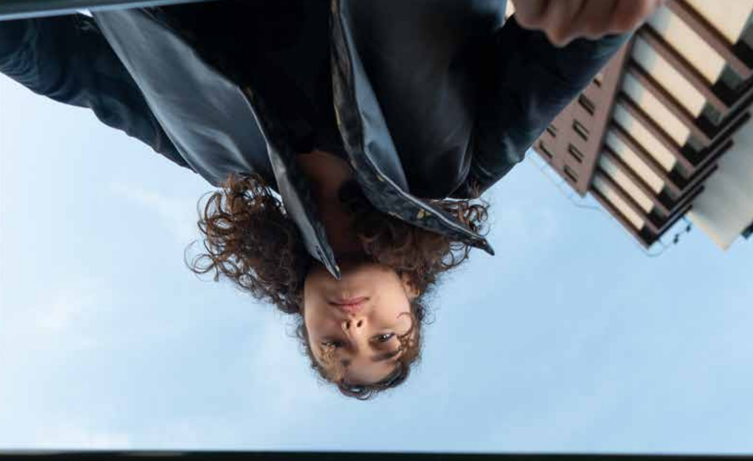
Let's leave a beautiful world for the future generations... See you soon!