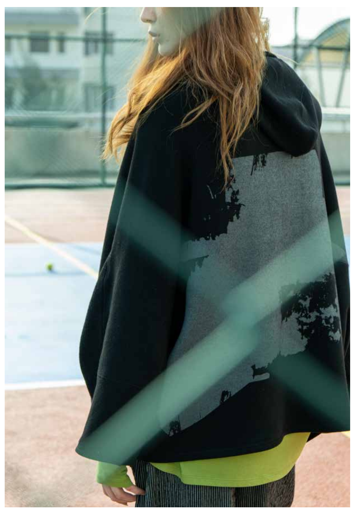
CARDIGAN HOPE 23K3o2 BLOUSE BASICS 23K13o PANTS FEEL 23K218